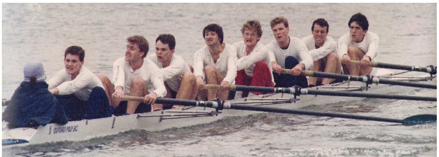
Oxford Polytechnic racing at the Reading University Head of the River Race, 1988

The message to all current students is that for Taurus to continue and to continue to support Brookes Rowing we need more members. New members are you — THE STUDENTS..... Please join and become a part of the Taurus Boat Club. It really is something special.