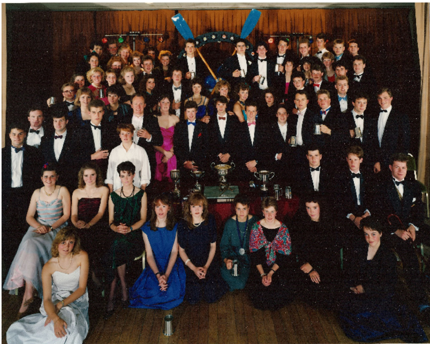
Top — OPBC annual dinner, Linton Lodge Hotel, 1988 (spot the faces...)