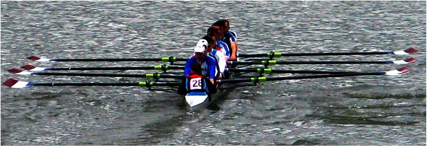
Flying without wings — Taurus takes on the Head of the River Race in 2010